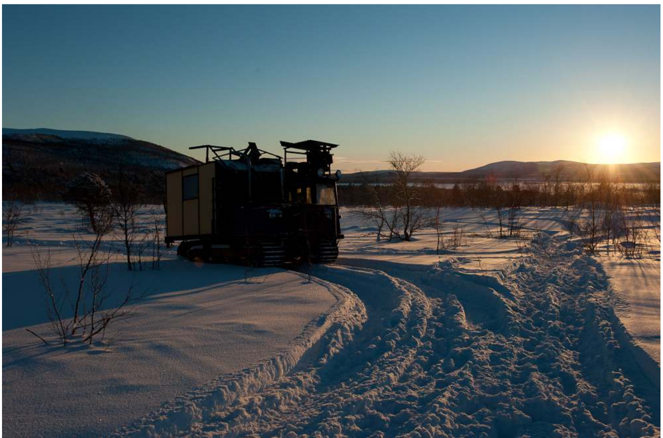
Figure 5: Drill rig in low sun