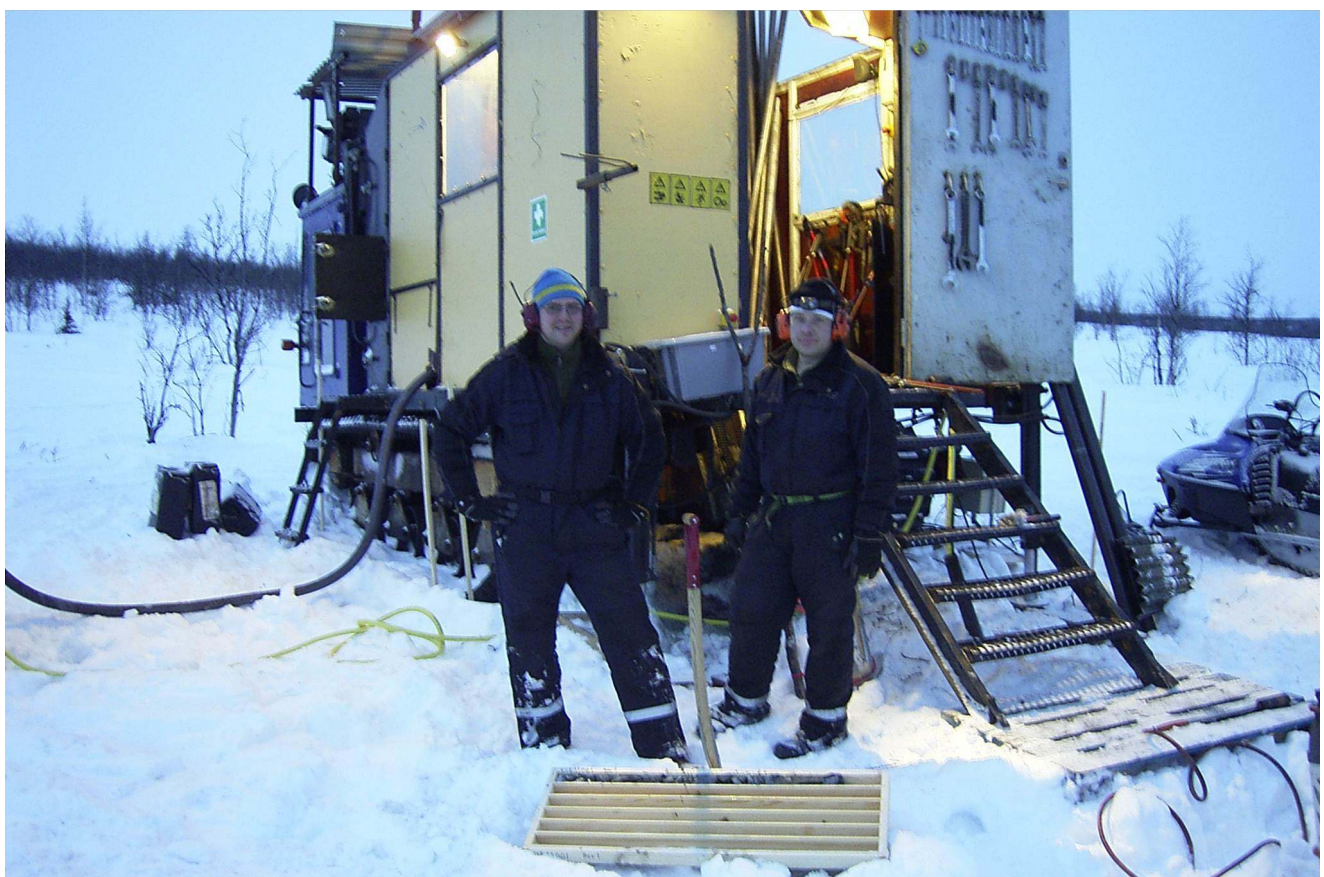
Figure 11: First drill core from Vieto