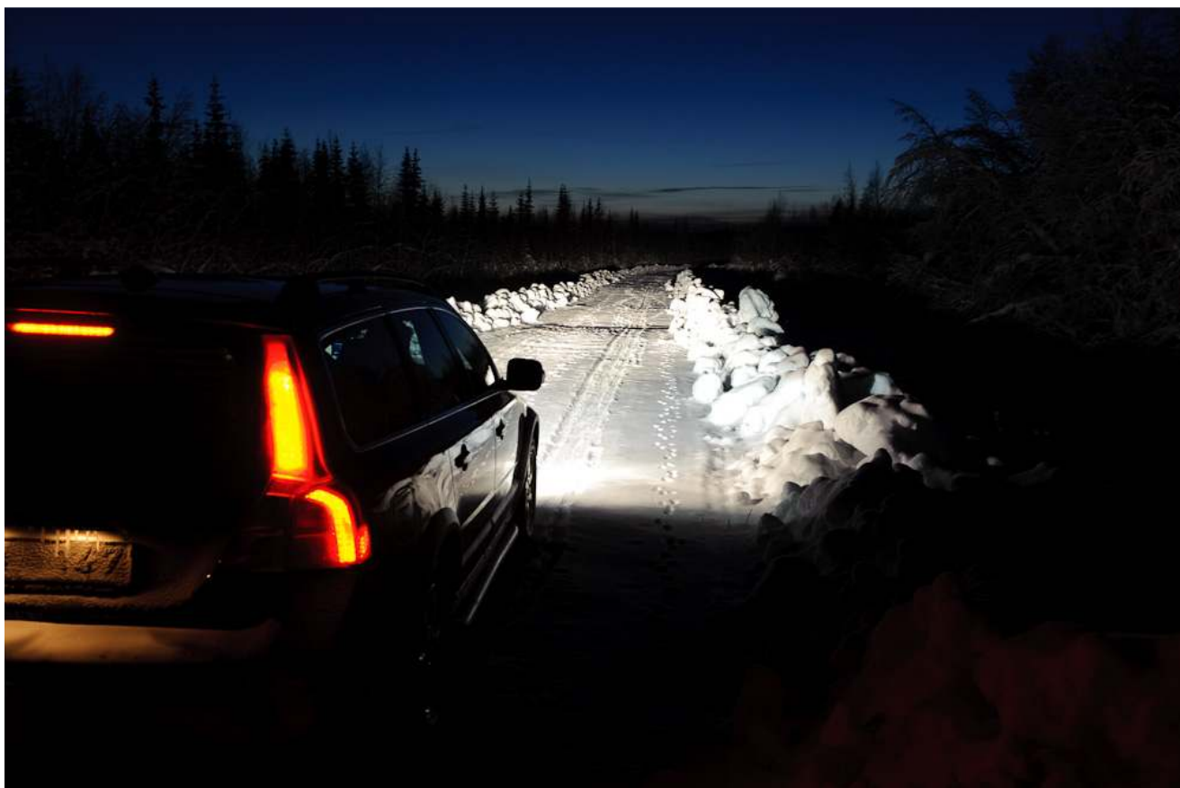
Figure 8: Drill access road up to the Sautusvaara ice road