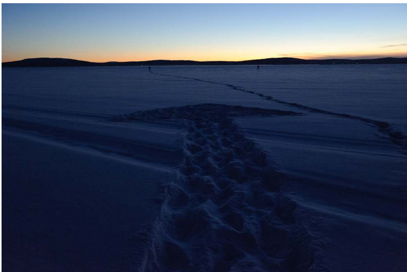
Figure 9: Ploughing “instruction” for drill site preparation on the Sautusvaara lake