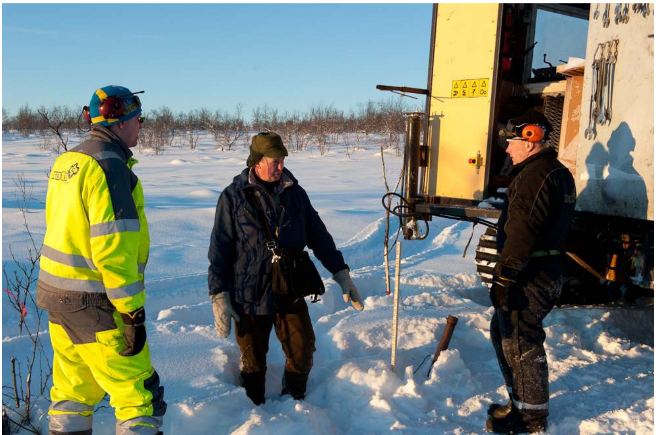
Figure 6: Discussion with drillers at first hole