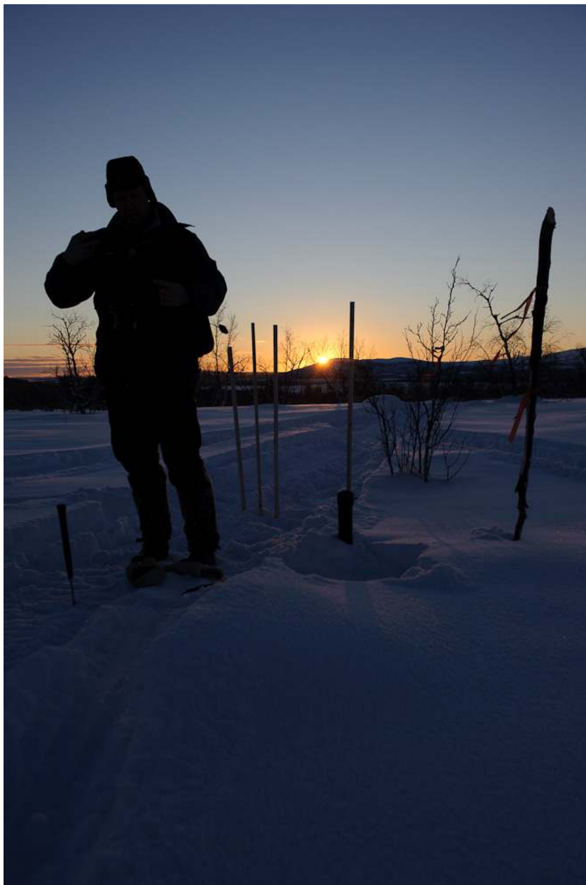
Figure 3: At the first twin hole to be drilled; VIE68904