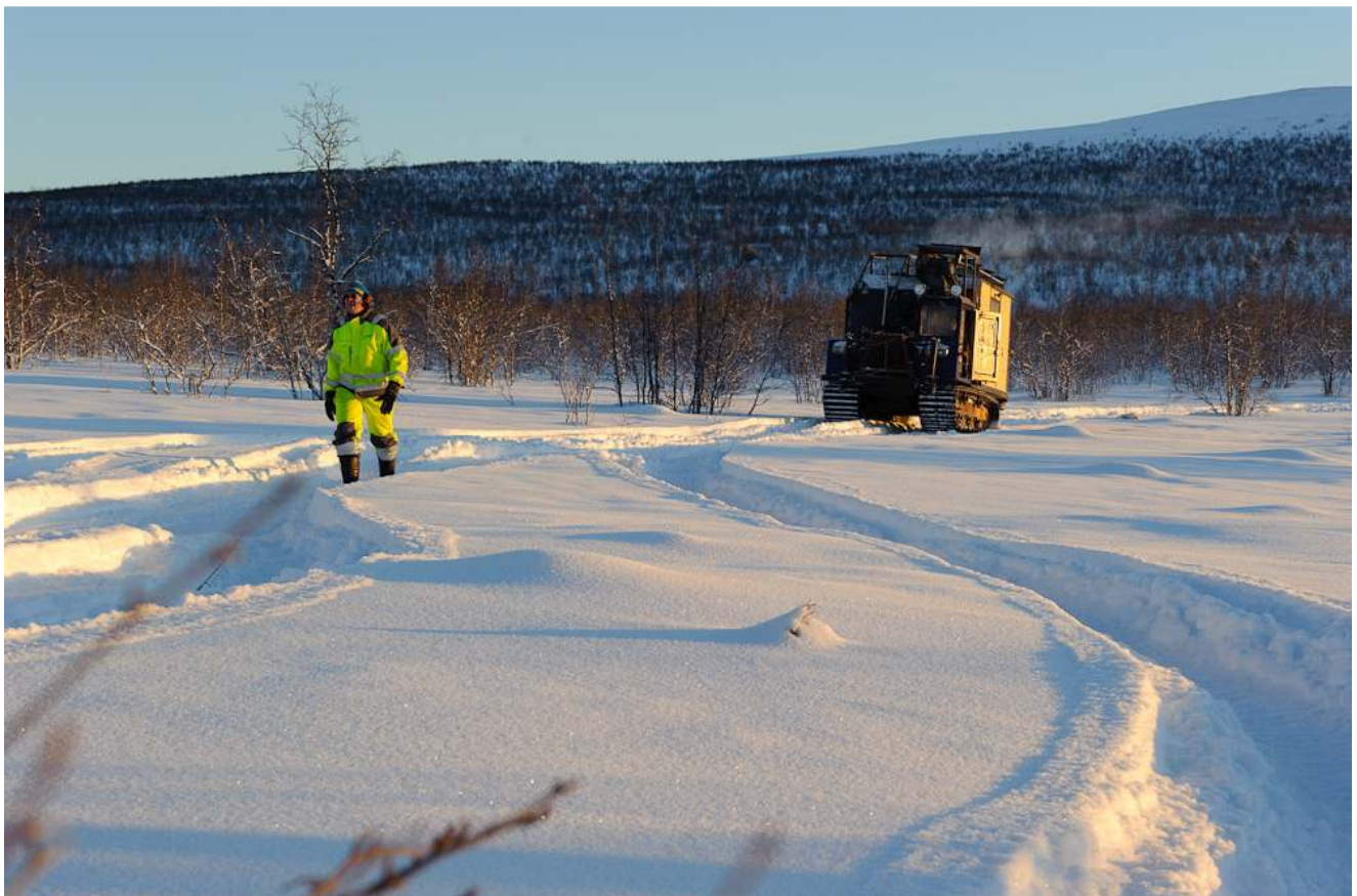
Figure 4: Drill rig on rubber tracks mobilising to the first drill site at Vieto