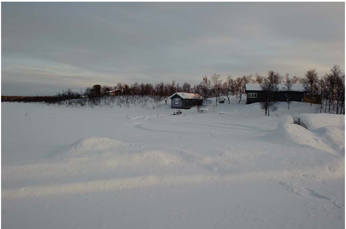
Figure 10: Summer houses located near a drill site