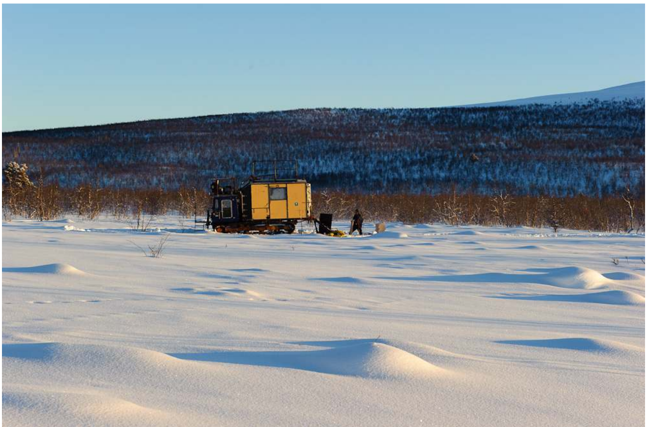
Figure 7: Location of first hole at Vieto