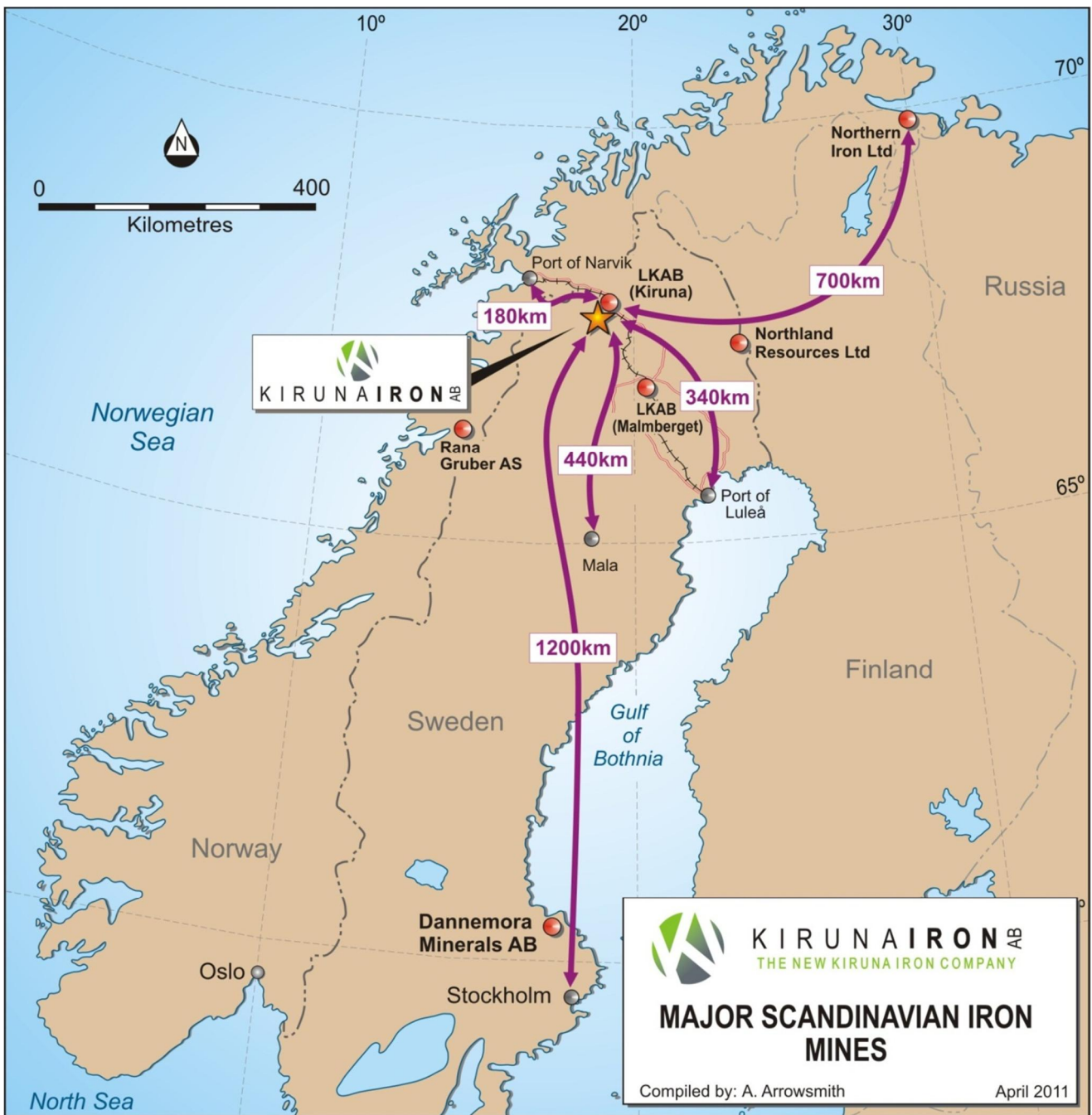
Figure 3. Kiruna Iron Location Map