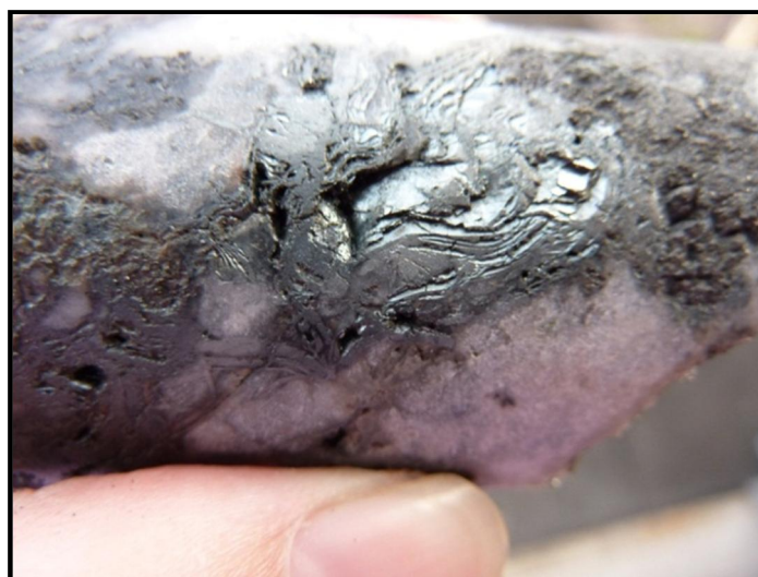
Figure 2. HAR11003-Platey hematite

The Harrejaure mineralisation is classified as 'apatite iron ore' rather than 'skarn iron ore' and contains significant amounts of hematite as well as magnetite (refer photograph of 'platey hematite').